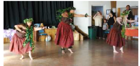
Three Woman Chant